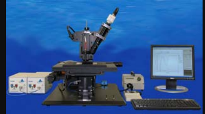
FilmTek™ 3000 PAR

FilmTek™ 3000 measures transmission and reflection of films deposited on transparent substrates. It is ideally suited for measuring the thickness and optical constants of very thin absorbing films deposited on transparent substrates. FilmTek™ 3000 combines fiber-optic spectrophotometers with SCI's proprietary material modeling software to provide an affordable and reliable tool for the simultaneous measurement of film thickness, index of refraction, and extinction coefficient. FilmTek™ 3000M has a small spot size (as small as 2 \mu\text{m} ) and can be equipped with a large custom stage for flat panel display applications. When equipped with the polarimetry option, FilmTek™ 3000P combines spectroscopic reflection, transmission, and polarimetry measurements for the accurate and simultaneous determination of optical constants and birefringence. The FilmTek™ 3000 PAR utilizes SCI's patented parabolic mirror technology developed for the FilmTek™ 4000EM-DUV to achieve a 50 \mu\text{m} measurement spot size and simultaneously measure wavelengths from the deep ultra-violet to the near infrared. FilmTek™ 3000 provides unmatched accuracy, ease of use, and analytical power in a fully integrated package.